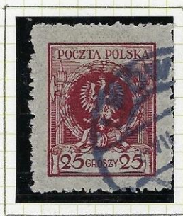
11\frac{3}{4} \times 11\frac{1}{2} ? fibrous thin paper Deep claret