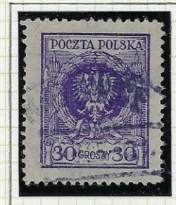
11\frac{1}{2} \times 11\frac{1}{2} Bluish shade Thin paper