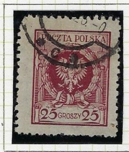
10\frac{1}{2} \times 10\frac{1}{2} Thin paper. Medium claret