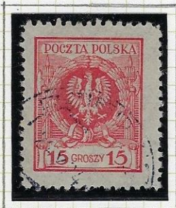
10 \frac{1}{2} x 10 \frac{1}{2} Very thin, smooth p. Very light shade.