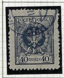
10 \frac{3}{4} x 10 \frac{1}{2} Medium paper Bluish slate