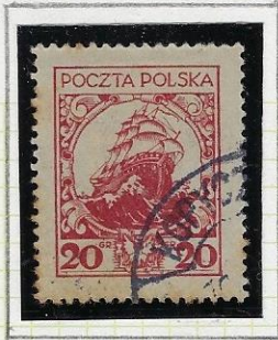
20gr carmine-red (plate I): Galleon at Sea. Ornamental Curl under "K" of POLSKA extends with two dots.