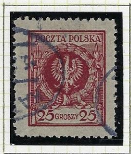
10\frac{1}{2} \times 10\frac{1}{2} Very thin paper Light claret.