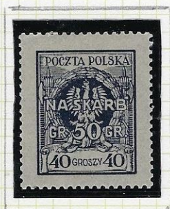
40gr + 50gr: slate.