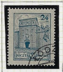
24gr grey-blue: Holy Gate ("Ostra Brama"), Wilno.