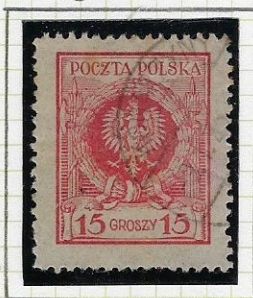
12 x 11 \frac{1}{2} Thin paper Light shade.

(Cl. R., but spot top right still there; so it isn't rust)