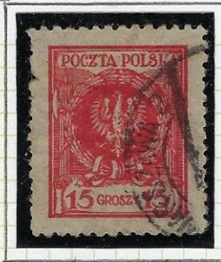
10 \frac{1}{4} x 10 \frac{1}{2} Thin paper Dark shade