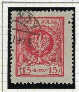
11 \frac{3}{4} x 11 \frac{1}{2} Medium paper Light shade.