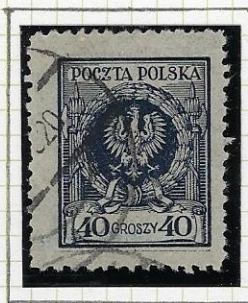
10 \frac{1}{2} x 10 \frac{1}{2} Thin paper Dark bluish slate