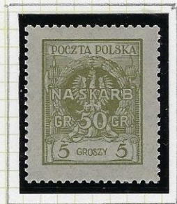
5gr + 50gr: sage-green.