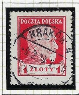
The printed stamp.

Basically the same, but differing from the approved version, it deviated from the latter in frame lettering, plating the word "ZŁOTY", and the type of suit the President was wearing.