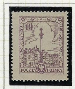
10gr violet (plate II): Redrawn, clearer design: White surround to figures.