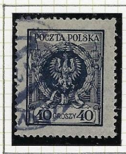
11 \frac{3}{4} x 11 \frac{1}{2} Thin paper