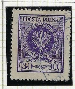
11\frac{1}{2} \times 11\frac{1}{2} Thickish paper Dark shade.