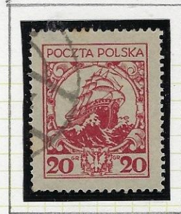
20gr carmine-red (plate II): Galleon at Sea. Curl under "K" of POLSKA has no dots.