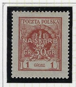
1gr + 50gr: yellow-brown.

1 Jan. 1925: National Fund . Stamps of the same values, colours and design as the previous series, but with the inscribed surcharge of 50gr on each stamp, with the words "NA SKARB" ("For the Treasury"). Printed typography; Perf. 12½.