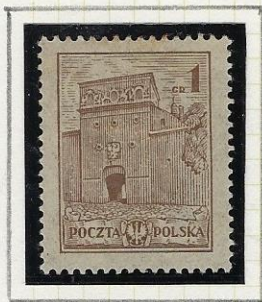
1gr brown: Holy Gate ("Ostra Brama"), Wilno.

1925 - 27: Various Views. Eleven stamps, printed type by PZG, Warsaw, on several types of paper and perforations. The 3gr, 5gr, 10gr, 15gr, 20gr, 30gr, and 40gr were printed from two different plates (the two types of 20gr not listed by St.Gibbons; the 20, 30, and 40gr not by Michel).