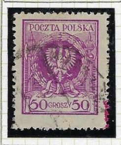
11 \frac{1}{2} x 11 \frac{1}{2} Medium paper Lilac-magenta.