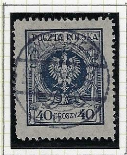
12 \frac{1}{4} x 12 \frac{1}{4} V. thin, smooth p. Light shade