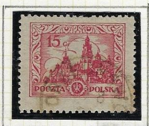
15gr carmine (plate I): Wawel Castle, Cracow. Coarse printing: Background lines touch the figures.