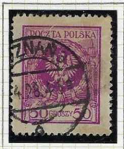
11 \frac{3}{4} x 11 \frac{1}{2} Smooth thickish p. Lilac-magenta