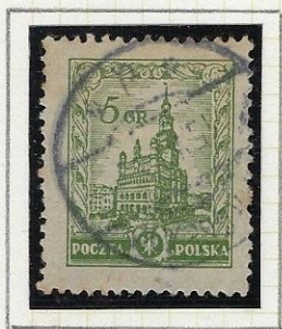
5gr green (plate I): Town Hall, Poznań Coarse printing: Background lines touch the figures.