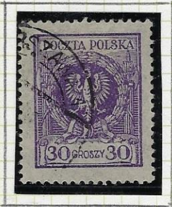
13\frac{3}{4} \times 11\frac{1}{2} Medium paper Purplish shade.