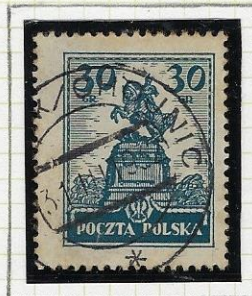
30gr dull blue (plate I): Jan III Sobieski Statue, Lwów. Background lines con- tinue through "GR"