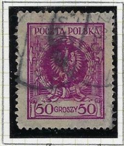
11 \frac{3}{4} x 11 \frac{1}{2} Smooth thin paper Purple-magenta