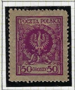
11 \frac{1}{2} x 11 \frac{1}{2} Thin paper Purple-magenta.