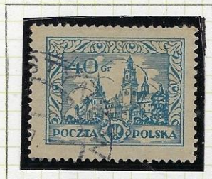
40gr light blue (Plate II): Wawel Castle, Cracow. "40" larger, 6½mm, and nearer to spire.