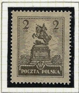
2gr brown-olive: Jan III Sobieski Statue, Lwów.