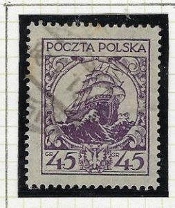
45gr mauve: Galleon at Sea. (One plate only: Type I with 2 dots).