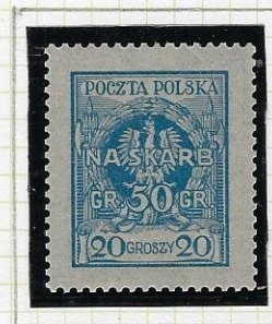
20gr + 50gr: light blue.