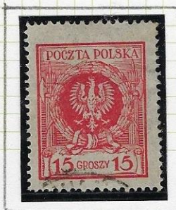
12 \frac{1}{2} x 13 Medium, coarse paper Medium shade.