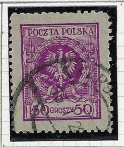
10 \frac{1}{2} x 10 \frac{1}{2} Thin paper Light shade