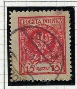
10 \frac{1}{2} x 10 \frac{1}{2} Thickish, coarse p. Darker, bright shade.