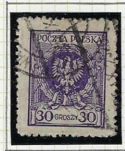
11\frac{3}{4} \times 11\frac{1}{2} Medium paper Dark greyish shade