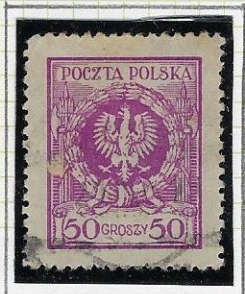
12 x 11 \frac{1}{2} Thickish paper