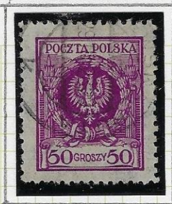
10 \frac{1}{2} x 10 \frac{1}{2} Thin paper Dark shade