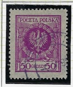
12 \frac{1}{4} x 11 \frac{3}{4} + 12 \frac{1}{2} x 11 \frac{1}{4} (unequal perforation) Smooth thin paper.