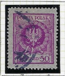
11 \frac{3}{4} x 11 \frac{1}{4} Fibrous thin paper Lilac-magenta.