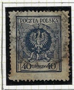
12 x 11 \frac{1}{2} Thin paper