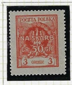
3gr + 50gr: orange.