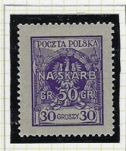
30gr + 50gr: bright violet.