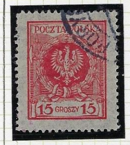
11 \frac{3}{4} x 11 \frac{1}{2} Thin paper Darker, bright shade

(Cl. R., but spot top right still there; so it isn't rust)