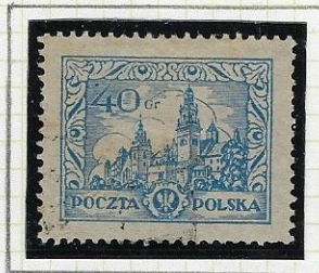
40gr light blue: (plate I): Wawel Castle, Cracow. "40" small, 6 mm across.