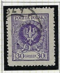
11\frac{1}{2} \times 11\frac{1}{4} Violet shade Medium paper