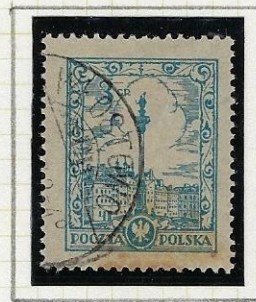
3gr pale blue (plate II): Redrawn, clearer design: White surround to figures.