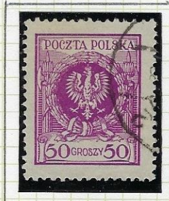
11 \frac{3}{4} x 11 \frac{1}{2} Smooth thick p. Magenta