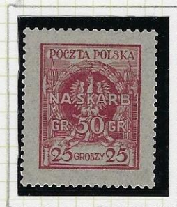
25gr + 50gr: claret.