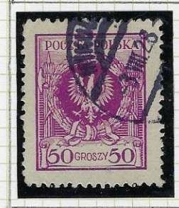
11 \frac{1}{2} x 11 \frac{1}{2} Thick paper Magenta