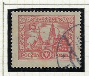
15gr carmine (plate II): Redrawn, clearer design: White surround to figures.

Quantities: 1gr 79,700,520; 2gr 6,000,000; 3gr (I) 10,000,000; 3gr (II) 7,040,000; 5gr (I) 30,300,000; 5gr (II) 326,440,000; 10gr (I) 25,400,000; 10gr (II) 237,900,000; 15gr (I) 40,750,000; 15gr (II) 216,470,420; (Contd. next page).