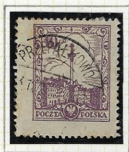
10gr violet (plate I): King Sigismund Wasa Column in Warsaw. Coarse printing: Background lines touch the figures.