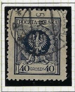
10 x 10 Thin paper Grey slate.