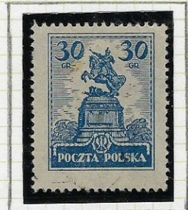
30gr dull blue (plate II): Jan III Sobieski Statue, Lwów. Background lines shor- tened to give white surround to "GR".