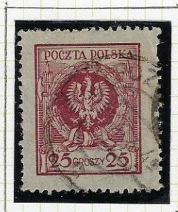
12 \times 11\frac{1}{2} Very thin fibrous paper