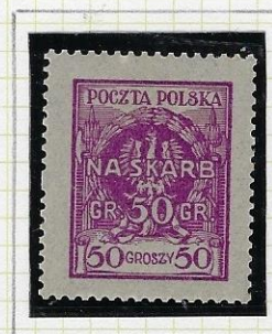
50gr + 50gr: magenta.

Quantities: 1, 2, 3, 5gr + 50gr 115,000 each; 10 + 50gr 105,000; 15gr + 50gr 115,000; 20gr + 50gr 105,000; 25, 30, 40gr + 50gr 115,000; 50gr + 50gr 105,000. Valid until 1.7.1934.