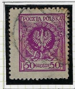
11 x 10 \frac{1}{2} Thin paper Light shade