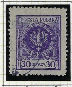
10\frac{1}{2} \times 10\frac{1}{2} Thin paper Darker bluish shade