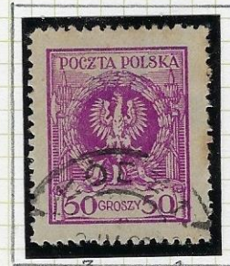
11 \frac{3}{4} x 11 \frac{1}{4} Smooth medium paper Magenta