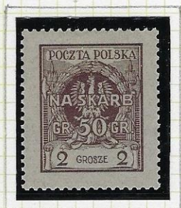
2gr + 50gr: grey-brown.