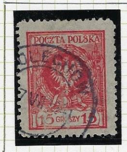
10 \frac{1}{2} x 10 \frac{1}{2} Thin, fibrous p. Medium shade.