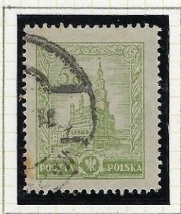
5gr green (plate II): Redrawn, clearer design: White surround to figures.