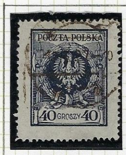
12 \frac{1}{2} x 12 V. thin, smooth p. Dark shade