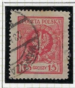
12 x 11 \frac{1}{2} Thin paper Medium, brighter shade