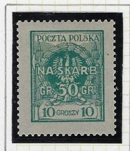
10gr + 50gr: blue-green.