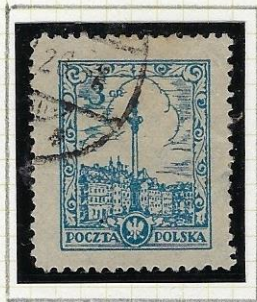
3gr pale blue (plate I): King Sigismund Wasa Column in Warsaw. Coarse printing: Background lines touch the figures.