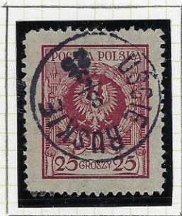
11\frac{3}{4} \times 11\frac{1}{2} smooth thin paper Medium claret