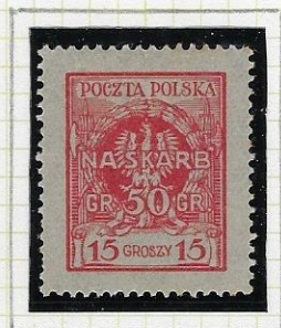
15gr + 50gr: scarlet.