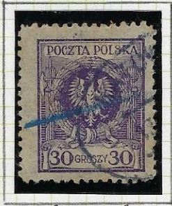
10\frac{1}{2} \times 10\frac{1}{2} Thin paper Light greyish shade